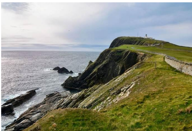
Puffin, Orcas, and Sumburgh Head (all photos in Shetland, courtesy of Shutterstock)