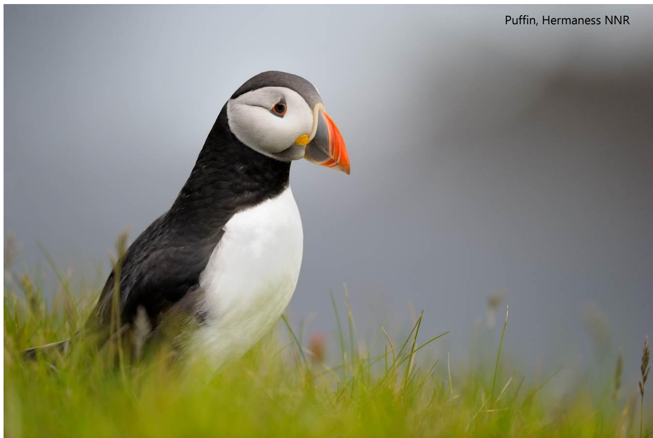
Puffin, Hermaness NNR

Once we arrive at the top, we will be able to admire the delightful Puffins that live life on the edge, plus, thousands of Gannets swirling below us. However, on the walk, we can expect a Great Skua or two to be eyeing us up as we pass within a limited range of their nesting sites. The passing of people here doesn't bother the skuas, but if someone should head off the path, then expect to be reprimanded by a skua!