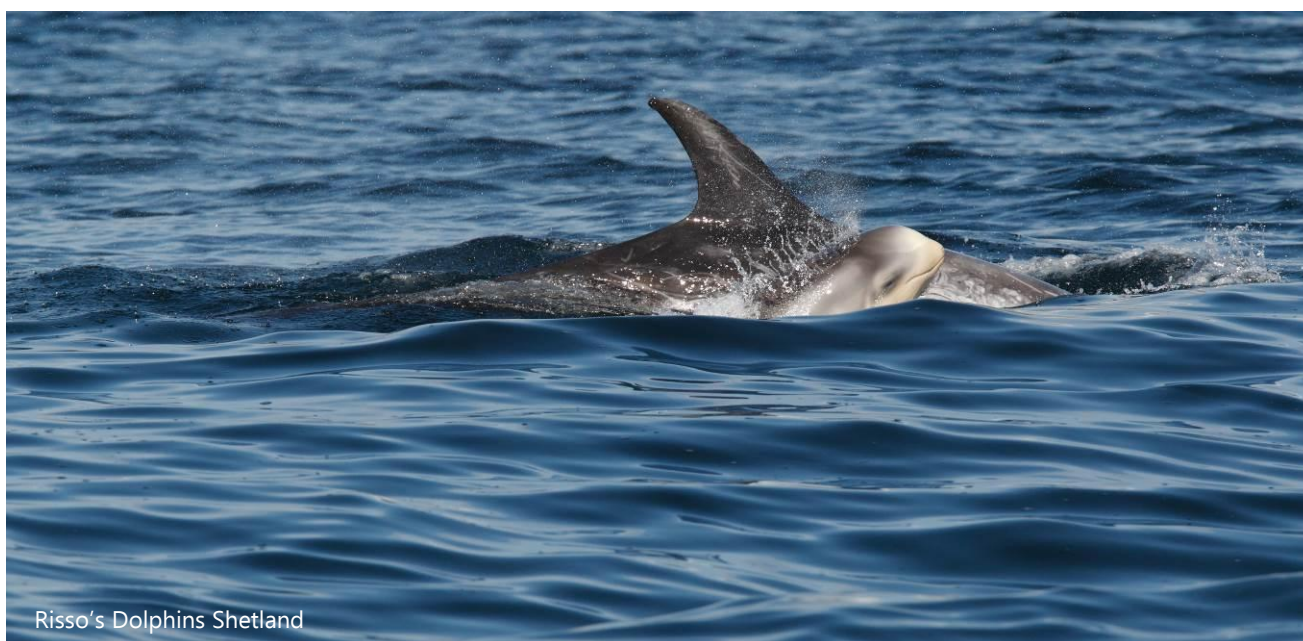
Risso's Dolphins Shetland

Although this tour is primarily bird and cetacean focused, we will also spend time searching for the beautiful mammals for which the Shetlands are so famed. Otters can be seen in sheltered voes and harbours, while Grey and Harbour Seals are particularly common along pristine sandy beaches.